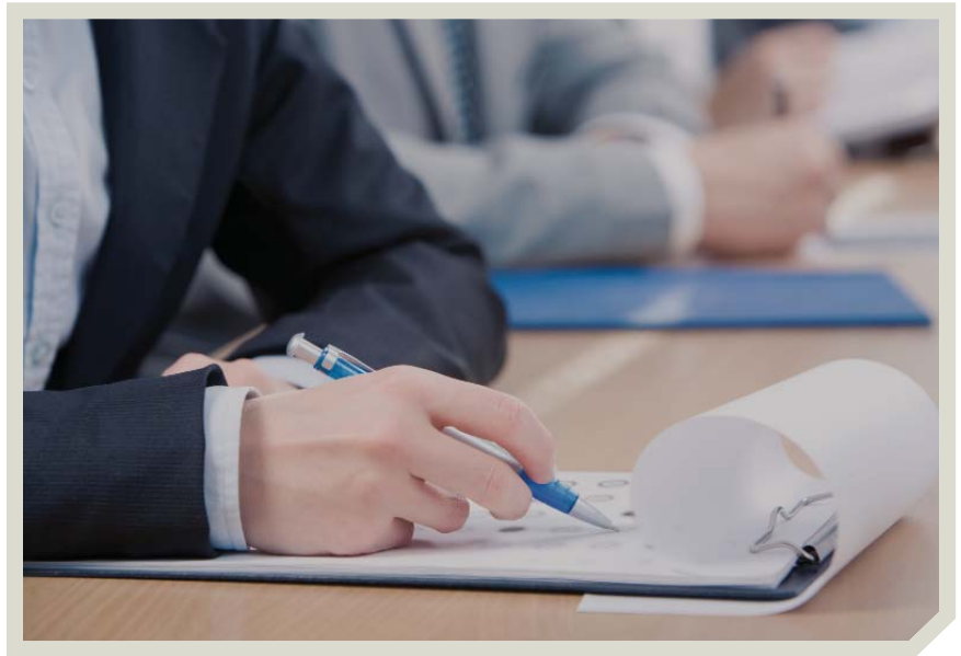
Differential psychology lends itself to practical application through its support for standardised testing in applied settings

At the same time, the international nature of the field makes it difficult to identify a uniquely 'British' differential psychology, at least in contemporary research. Indeed, the leading British researchers had an international outlook. Spearman was a student of Wundt, Eysenck was familiar with Continental schools of thought on personality, and Gray was influenced by the neo-Pavlovian psychology of the Soviet Union. We can point to the historical influence of the