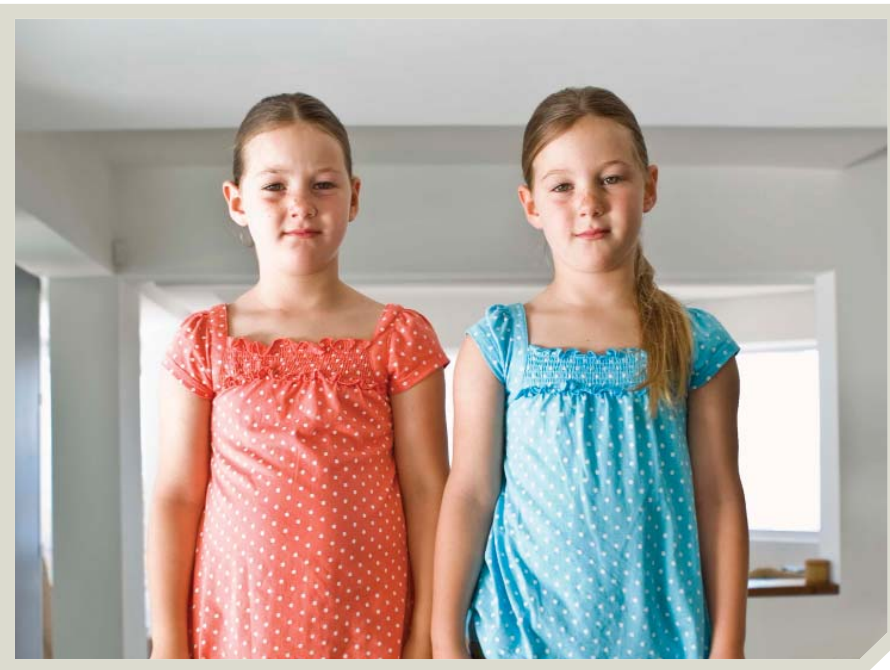
Longitudinal twin research has examined the impact of children's beliefs on their later academic achievement

A natural extension of the work on intelligence is to explore the nature of emotional intelligence (EI). One of the most notable contributions to this literature is the work of K.V. Petrides and